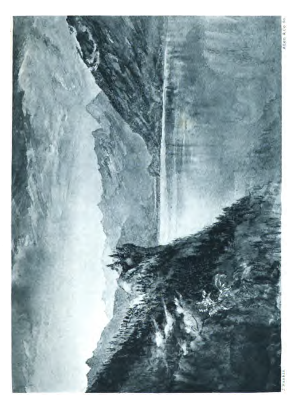
Lake of Brien 3: View from the Giessbach Hotel